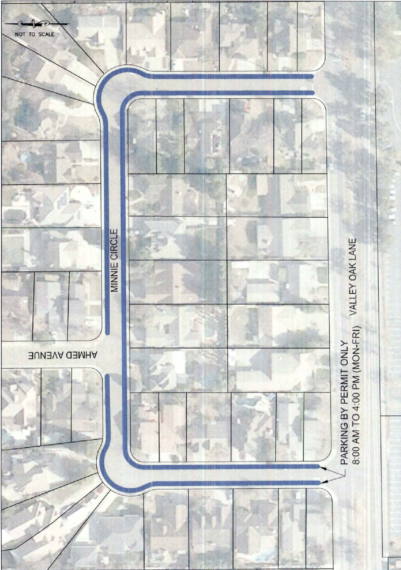
EXHIBIT A - PREFERENTIAL PERMIT PARKING ZONE 8:00AM TO 4:00PM (MON.-FRI.) ALL OF MINNIE CIRCLE